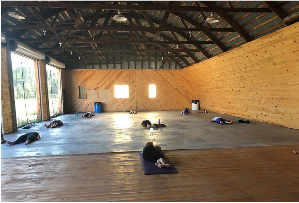
Lake Effect Yoga held in the Silver Creek Pavilion this summer.